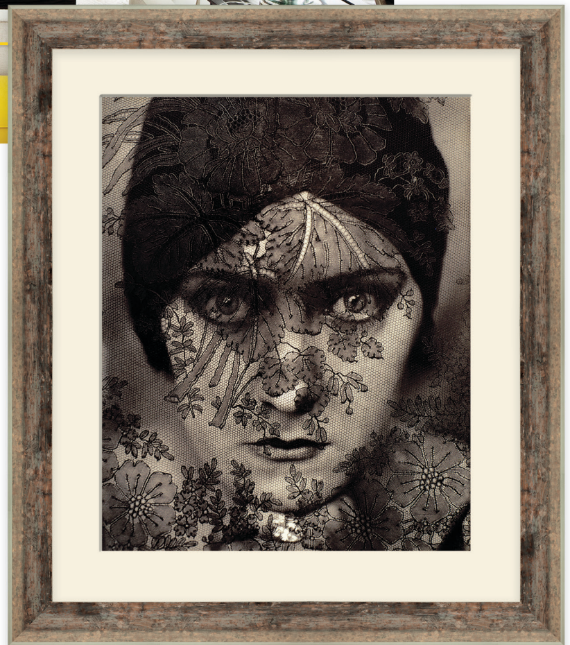
△ Above: 84053, pewter/bisque (2 3/4") Portrait of Gloria Swanson, by Edward Steichen

Theo is a transitional collection with an inherently vintage feel. It is an excellent choice for framing etchings, black and white photography, lithography, art deco era prints, and industrial urban themed artwork. The larger items of the collection are exquisite for framing mirrors (84051-53, 2 3/4").